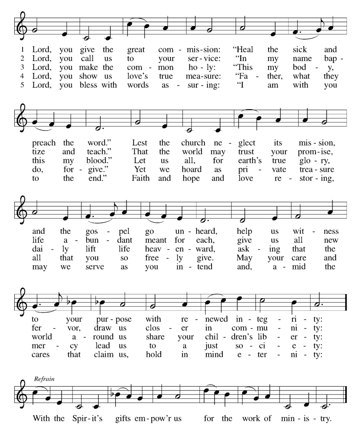
Lord, You Give the Great Commission