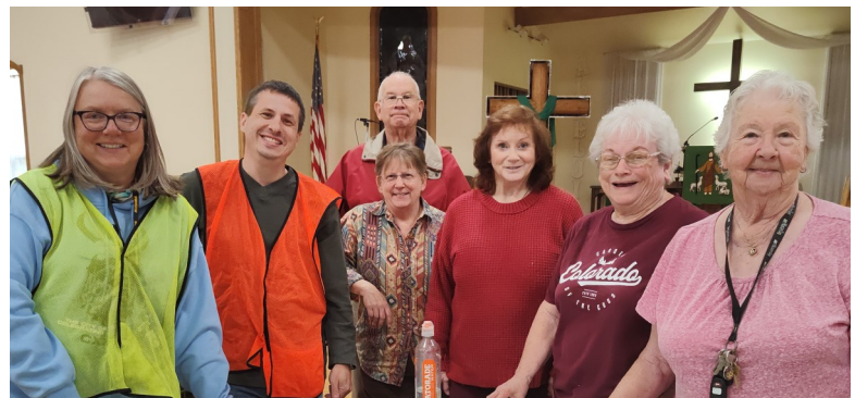
Feeding America, Thursday, October 3